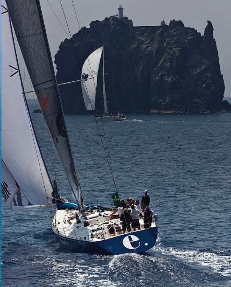
3rd place finisher EDIMETRA, Boat: WALLY 65 Designer: G. FRERS, LOA: 20,01 M.