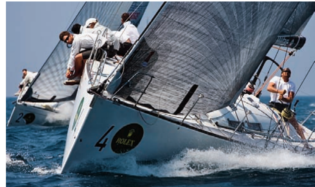
1st place winner ALEGRE (GBR), sails past Sperlonga, Italy Boat: MILLS 68, LOA: 21, 01 M.